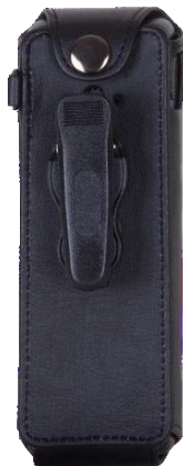
Synthetic Leather Phone Case