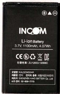
Lithium ion Battery