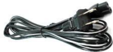
Power Cable (CE, US, UK Type – Choose 1)