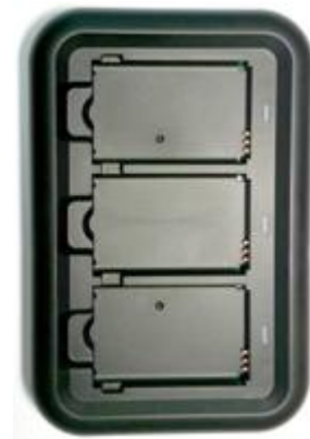
Battery Multi Charger (3 Slots)